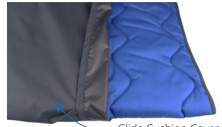
Glide Cushion Cover