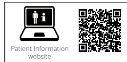
Patient Information website

Wash at 30-74°C. Tumble dry on low heat. Do not iron. Do not use bleach. Do not use fabric conditioner